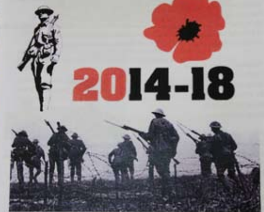
To mark the 100<sup>th</sup> anniversary of the beginning of the 1<sup>st</sup> World War

We hope to research the Depot at Donnington and its roll during World War II. and look at the history of GKN Sankey, Walkers and Russells.